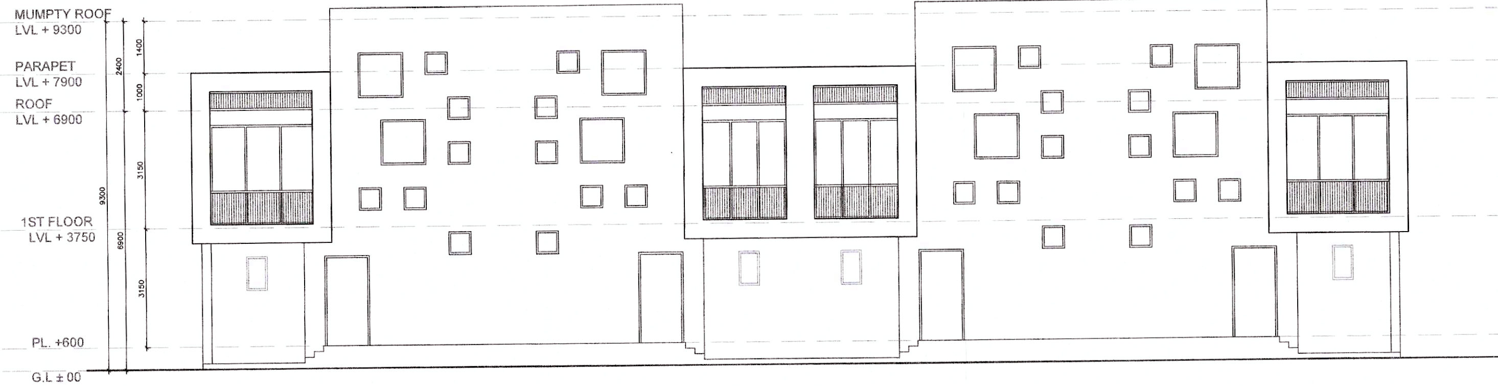
FRONT SIDE ELEVATION SCALE - 1:100